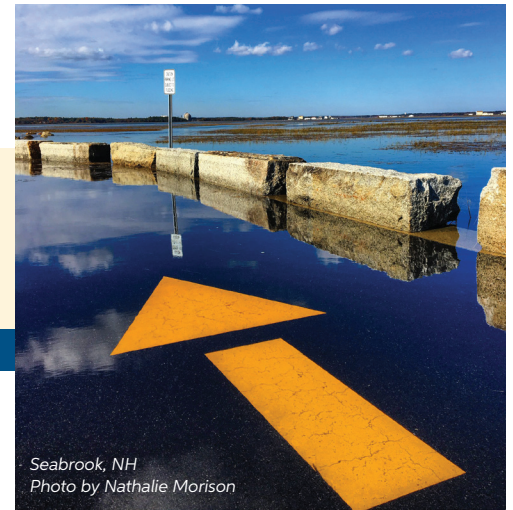
Seabrook, NH

Key CRHC Recommendations: CC7, E2, NR2, NR3, NR4, H4