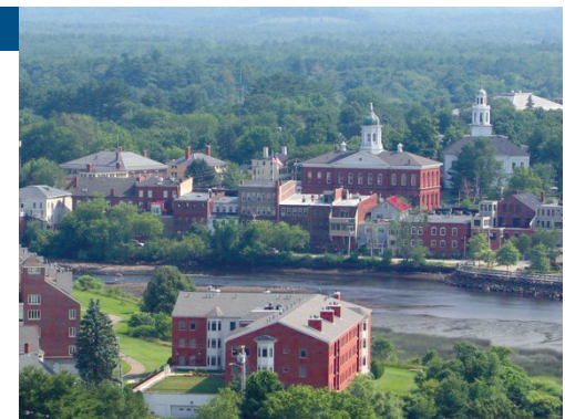
Known historical landmarks at risk of flooding under all sea-level rise scenarios include the Back River Farm in Dover, the Durham Historic District, the Margeson/Richman Estate in Newington, and the Waterfront Commercial Historic District and the Front Street Historic District in Exeter. Photo of downtown Exeter by Erich Winch.